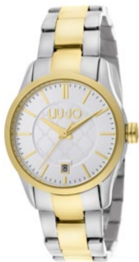
TLJ 950 Q: Silver Bianco / Silver White C: Bicolore Oro / Bicolor Gold 159,00 €