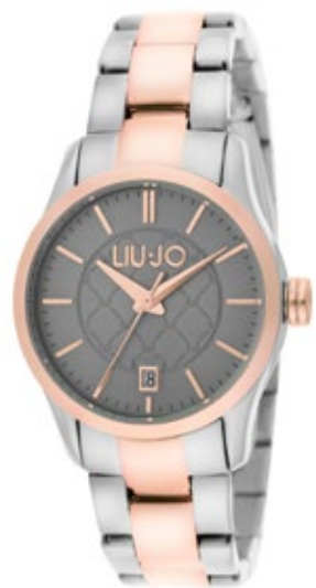
TLJ 951 Q: Tortora / Warm Grey C: Bicolore Oro Rosa / Bicolor Rose Gold 159,00 €