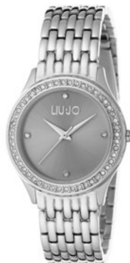
TLJ 1066 Q: Grigio / Grey C: Silver 159,00 €