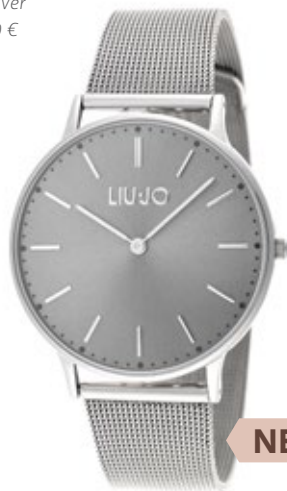
TLJ 1057 Q: Grigio / Grey C: Silver 149,00 €