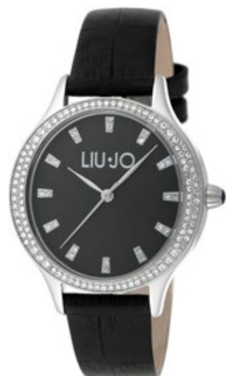
TLJ 1007 Total Black 149,00 €