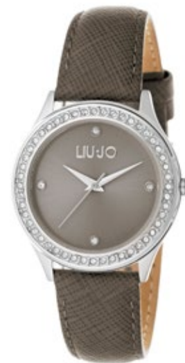
TLJ 1064 Q: Tortora / Warm Grey C: Tortora / Warm Grey 129,00 €