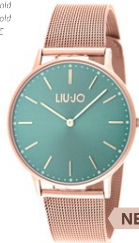
TLJ 1058 Q: Verde Petrolio / Green C: Oro Rosa / Rose Gold 169,00 €