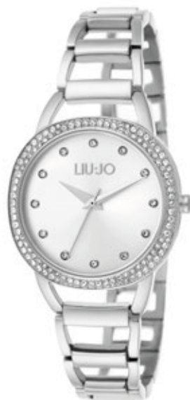
TLJ 1032 Total Silver 179,00 €

BAND: in stainless steel. Stainless steel clasp with external logo.