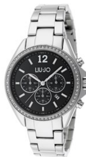
TLJ 1037 Q: Nero / Black C: Silver 209,00 €