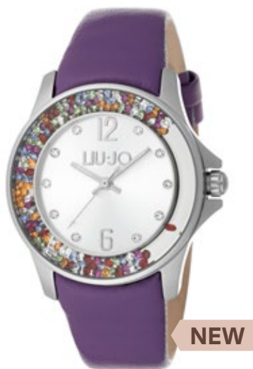
TLJ 1053 Q: Silver C: Prugna / Plum 189,00 €