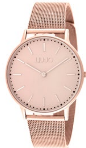
TLJ 971 Total Oro Rosa Total Rose Gold 169,00 €