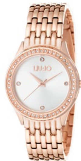
TLJ 1067 Q: Silver C: Oro Rosa / Rose Gold 179,00 €