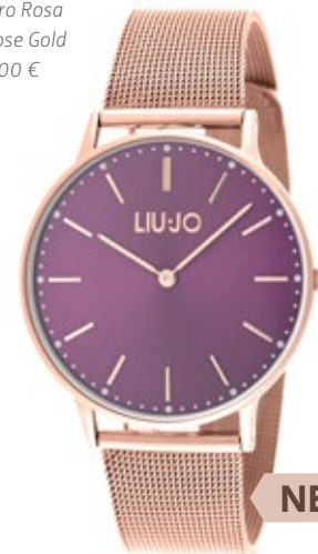
TLJ 1059 Q: Prugna / Plum C: Oro Rosa / Rose Gold 169,00 €