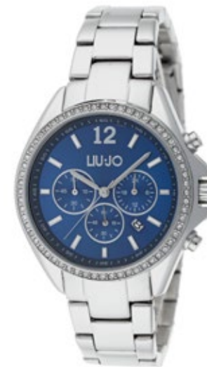
TLJ 1038 Q: Blu / Blue C: Silver 209,00 €