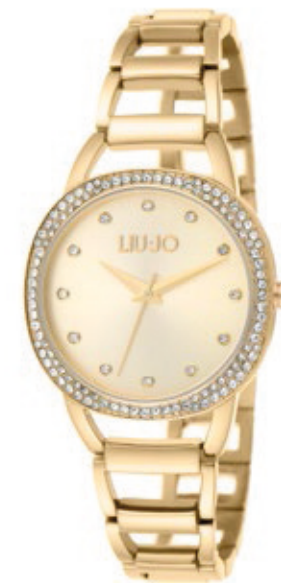
TLJ 1034 Q: Champagne C: Oro / Gold 199,00 €