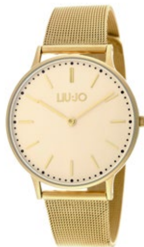
TLJ 970 Q: Light Gold C: Oro / Gold 169,00 €