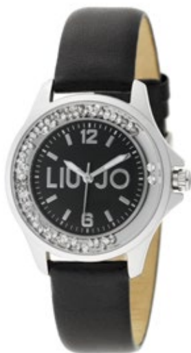
TLJ 742 Total Black 149,00 €