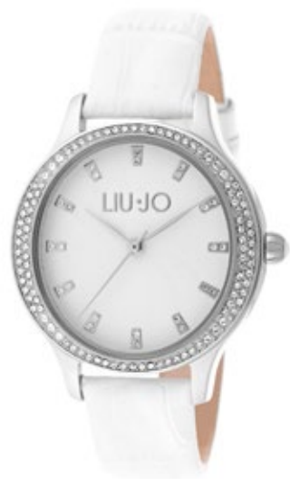
TLJ 1006 Total White 149,00 €