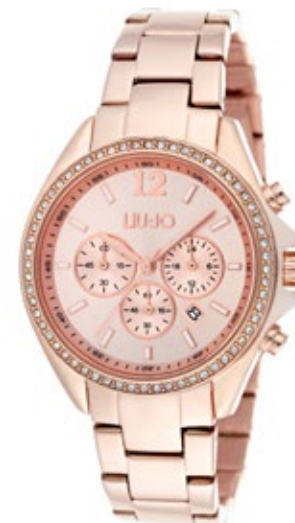
TLJ 1040 Total Oro Rosa / Total Rose Gold 229,00 €