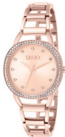
TLJ 1035 Total Oro Rosa / Total Rose Gold 199,00 €