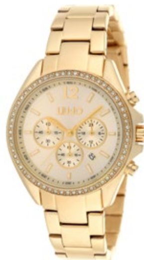
TLJ 1039 Q: Champagne C: Oro / Gold 229,00 €