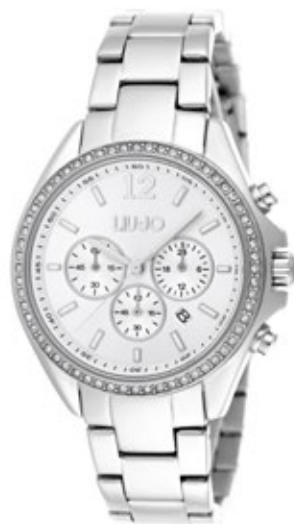
TLJ 1036 Total Silver 209,00 €

MOVEMENT: quartz Miyota FS20-4.5H. FUNCTIONS: hours, minutes, seconds, date, chronograph. CASE: in stainless steel, diameter 38 mm, bezel with white crystals, screw case back. Mineral glass and stainless steel crown. Available also in IP gold and IP rose gold. WATER RESISTANCE: 5 atmospheres. DIAL: sunray with Arabic numbers and index in Upper Plating, Liu jo logo in Upper Plating. BAND: in stainless steel, clasp with external logo.