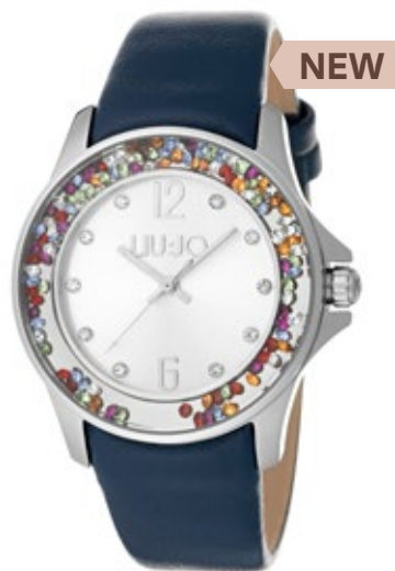
TLJ 1052 Q: Silver C: Blu Scuro / Dark Blue 189,00 €