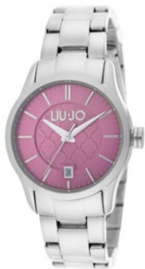
TLJ 938 Q: Prugna / Plum C: Silver 139,00 €