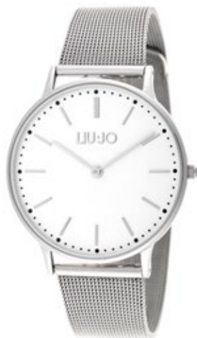
TLJ 969 Total Silver 149,00 €

STRAP: in leather, buckle with laser engraved logo.