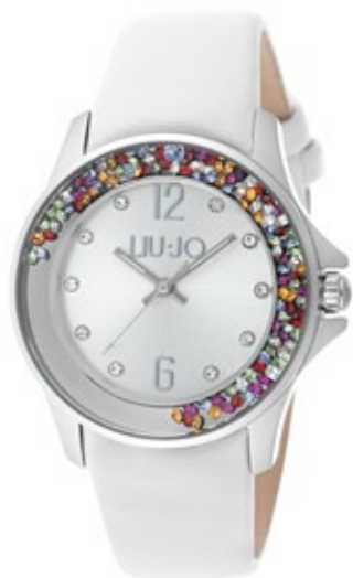
TLJ 998 Q: Silver C: Bianco / White 189,00 €