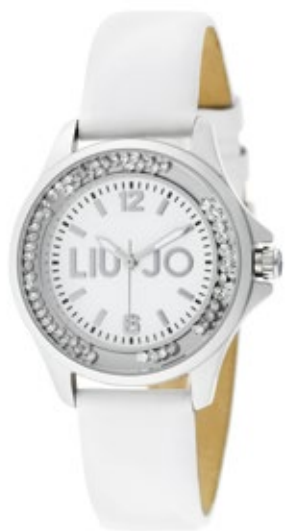
TLJ 740 Total White 149,00 €