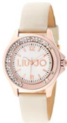
TLJ 744 Q: Light Champagne C: Avorio / Ivory 159,00 €