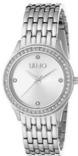
TLJ 1065 Total Silver 159,00 €

STRAP: colored "saffiano" leather strap. Stainless steel personalized buckle.