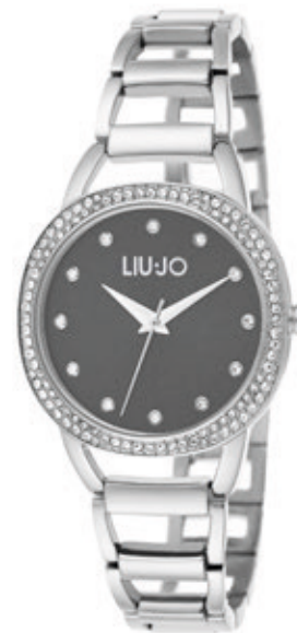
TLJ 1033 Q: Grigio / Grey C: Silver 179,00 €