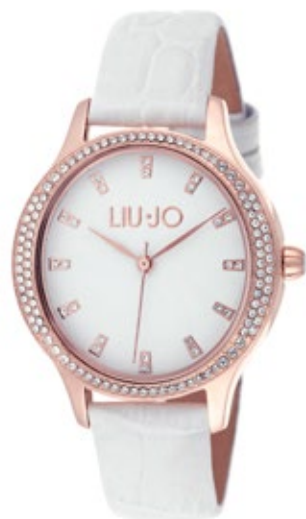
TLJ 1008 Total White 159,00 €